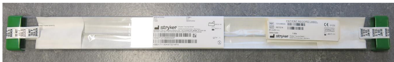
Exemplo de embalagem - bolsa estéril dentro tubo claro (plástico)

Nenhuma lesão ou dano foi reportado para este evento.